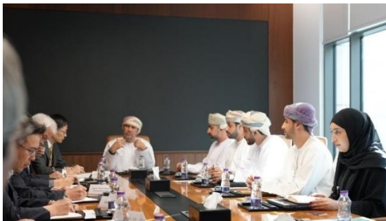
Meeting with Invest Oman

On December 18, the mission returned to Muscat and visited “Invest Oman,” a government agency focused on promoting investment. Invest Oman explained their cross-ministerial one-stop services, where staff seconded from various ministries collaborated to provide streamlined support. The agency also offered participating companies specific advice for expanding their business operations in Oman.