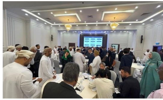
Individual Business Meeting