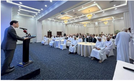
Scenes from the Business Seminar