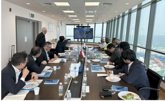
Visit to Port of Duqm