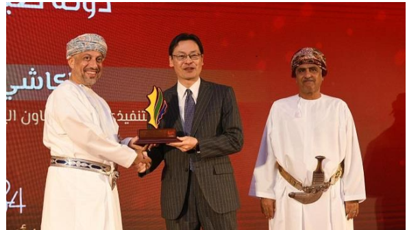
Special award at the Al Roya Business Awards