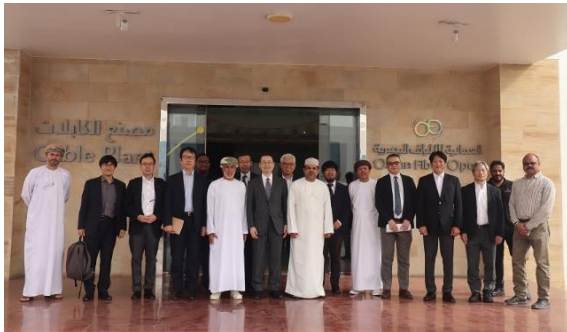
Visit to the Rusayl Industrial Estate

On December 16, the mission visited the Rusayl Industrial Estate near the capital city of Muscat, where they conducted discussions and facility tours with organizations such as Madayn (the Public Establishment for Industrial Estates), Oman Cables (a manufacturer of electric cables), and Oman Fiber Optic (a manufacturer of fiber optic cables). Following this, they visited the Al Ghubrah II IWP desalination plant in Muscat, where they received a briefing on its operations from the Muscat City Desalination Company and conducted a site inspection.