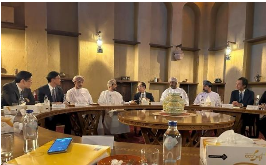
Courtesy visit to H.E. Qais Al-Yousef, the Minister of Commerce, Industry and Investment Promotion

Against this backdrop of expanding business opportunities in climate technology, JCCME, with the support from the Ministry of Economy, Trade and Industry of Japan (METI), the Embassy of Japan in Oman, and the Embassy of Oman in Japan, as well as in cooperation with the Oman Chamber of Commerce and Industry (OCCI), dispatched a business mission to Oman from December 15 to 19, 2024. The mission comprised representatives from eight Japanese companies (ten participants).