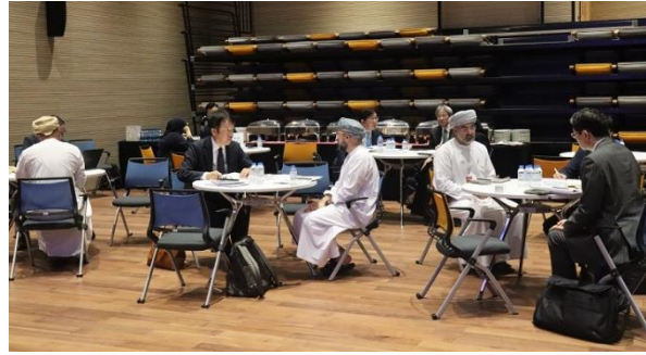
Individual meetings with government agencies