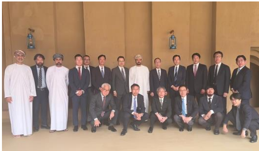
Commemorative photo with Minister Qais