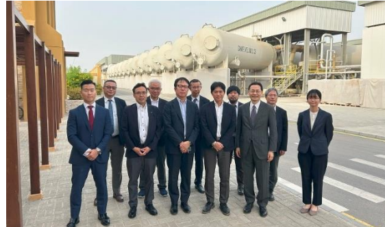
Visit to Al Ghubrah Desalination Plant

On December 17, the mission traveled to the Duqm Special Economic Zone, a major development project led by the Omani government. They received briefings from Port of Duqm and Duqm Drydock, and engaged in discussions and site visits with companies such as ACME Group and Vulcan Green Steel, which are conducting hydrogen-related projects within the economic zone.