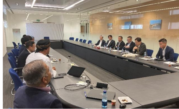
Exchange of opinions at the Duqm SEZ

On December 18, the mission returned to Muscat and visited “Invest Oman,” a government agency focused on promoting investment. Invest Oman explained their cross-ministerial one-stop services, where staff seconded from various ministries collaborated to provide streamlined support. The agency also offered participating companies specific advice for expanding their business operations in Oman.