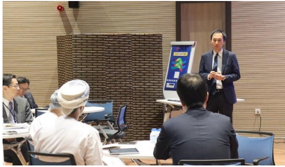
Roundtable discussions with government agencies