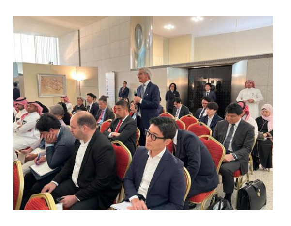
Q&A Session (2)