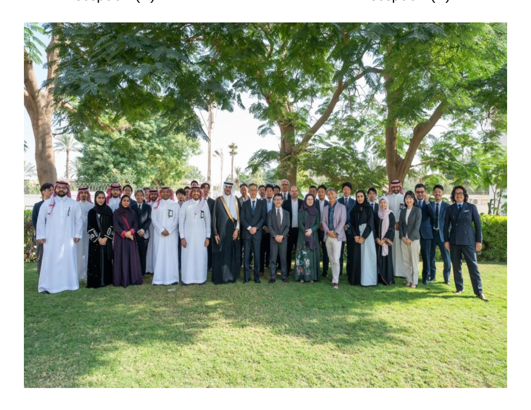
All Distinguished Guests and Workshop Participants

The reception following the seminar facilitated further active exchanges of ideas between participants from MWAN and Japanese companies, strengthening their close communications.