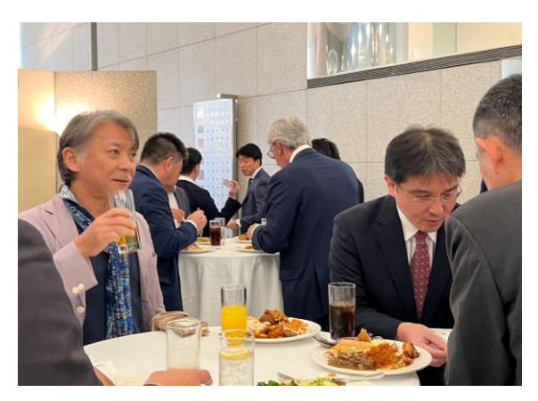
Reception (1) Reception (2)